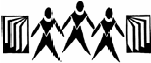
St. Peter Friends of the Library

Friends are people who want to help the St. Peter Public Library continue be an active and vital part of our community.